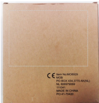
4. BACK PD