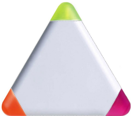
4. BACK PD