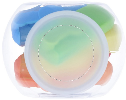
4. TOP LID