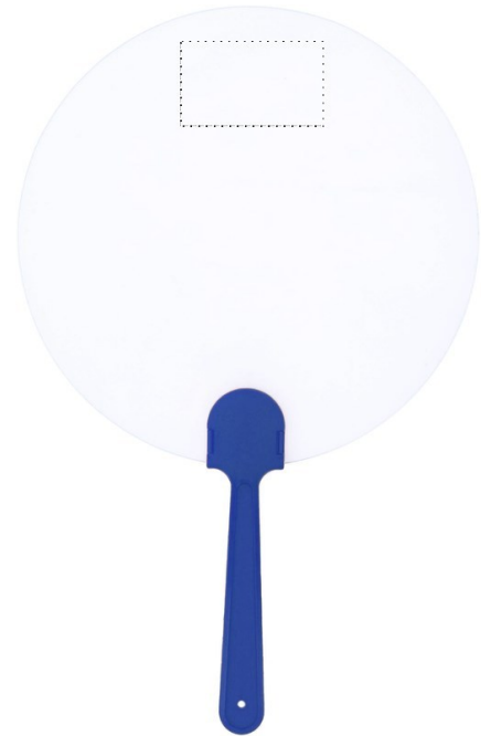
3. FRONT PAD