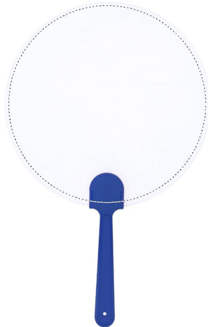
5. BACK PD